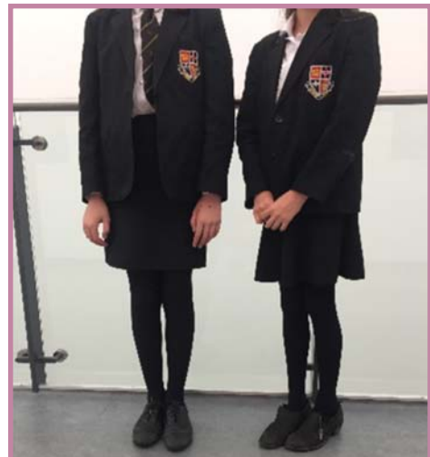
Examples of the correct school uniform